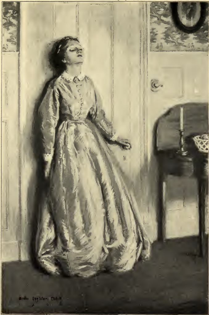
"WHEN HE HAD GONE, SHE WENT INTO THE PARLOR AND SHUT THE DOOR"